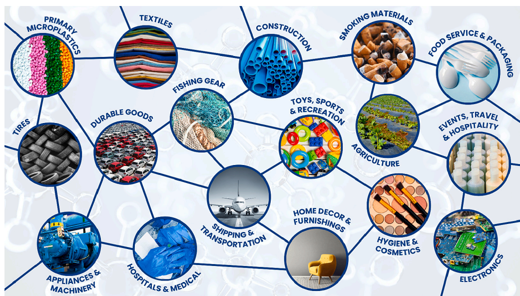
Fig. 2. Plastic use in society is diverse. Here, we show 17 proposed sectors of plastic use in society. Each sector will have tailored solutions.

recycling, landfill, incineration, composting, environmental leakage).